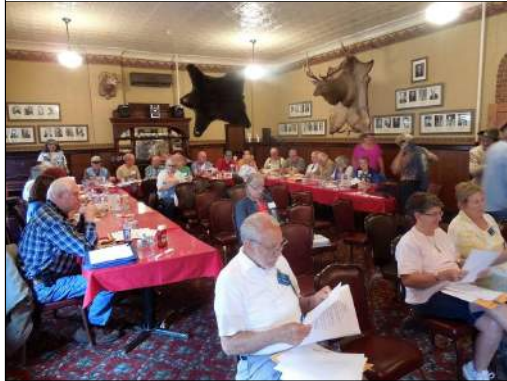
Getting ready for the RMFMS Delegates Meeting.

Thank you Cody, WY for a beautiful setting for our convention!