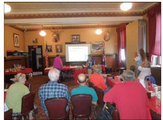
Setting up for Breakfast with the Editors and Webmasters.