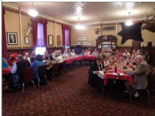
2015 RMFMS Awards Banquet.