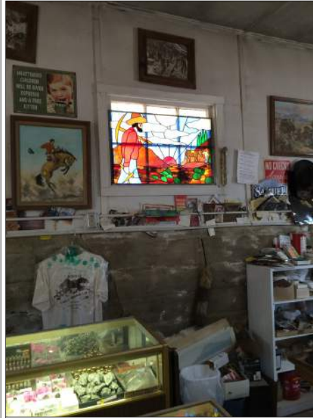
The Eagle Mine gift shop in Julian, CA.

... rockhounds love what nature provides through geology.