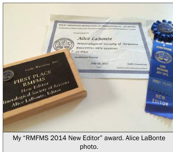
My "RMFMS 2014 New Editor" award.