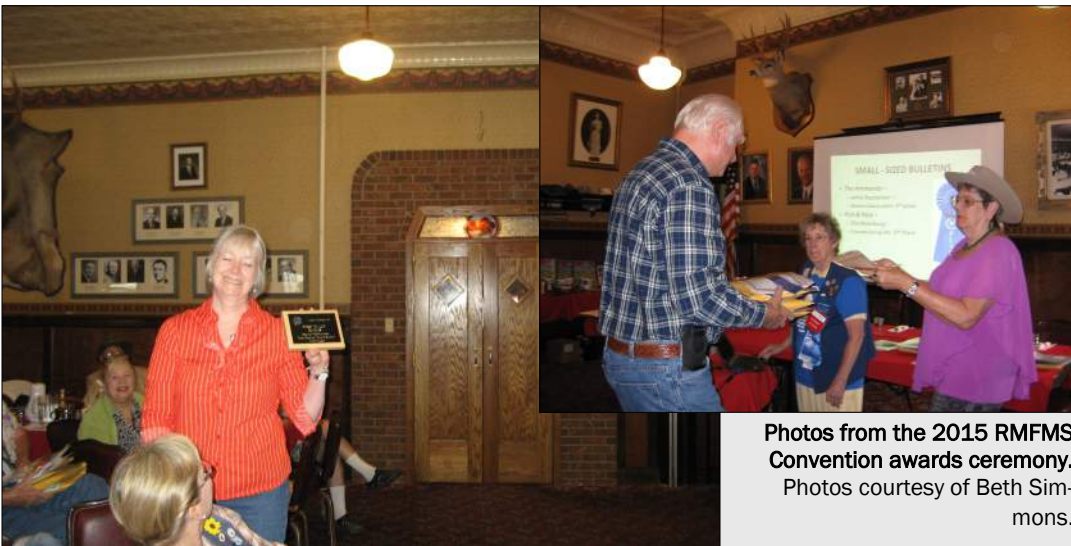
Photos from the 2015 RMFMS Convention awards ceremony.

I know that next year more clubs will participate and make the judges' work even more difficult!