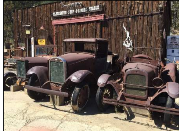
Outside The Eagle Mine gift shop in Julian, CA.