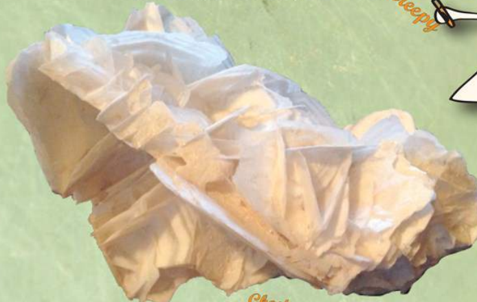
Ghost OMGS "Angel Wing" Calcite